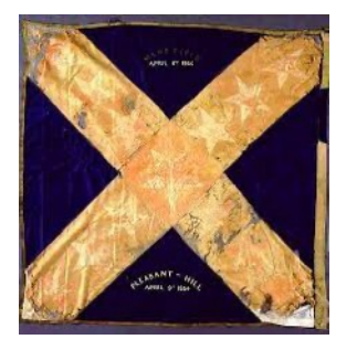
14th Texas Infantry