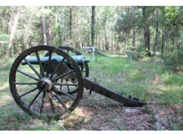
Douglas' Texas Battery