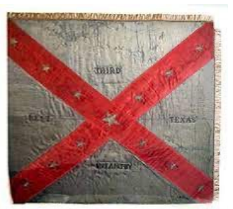
3rd Texas Infantry.