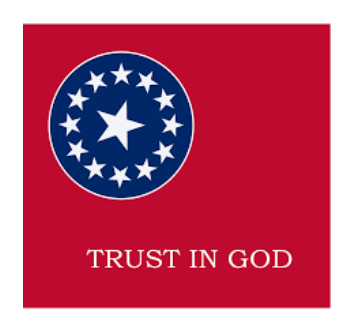
17th Texas Infantry.