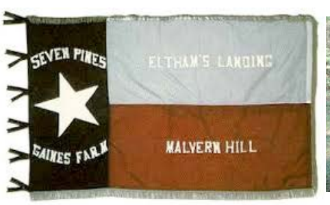
1st Texas Infantry