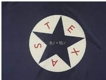
15th Texas Infantry