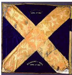
14th Texas Infantry