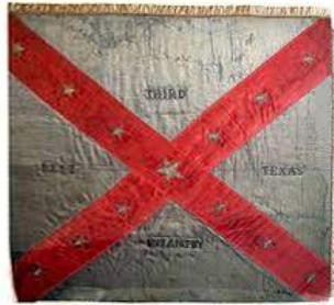
3rd Texas Infantry.