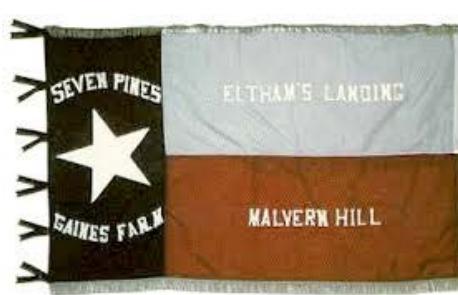
1st Texas Infantry