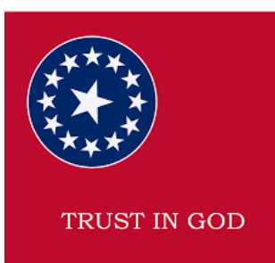
17th Texas Infantry.