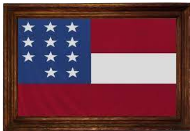
11th Texas Infantry