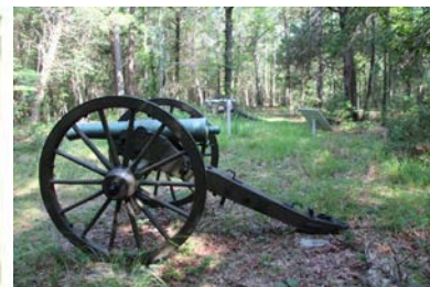
Douglas' Texas Battery