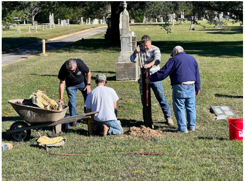
Compatriots working hard!