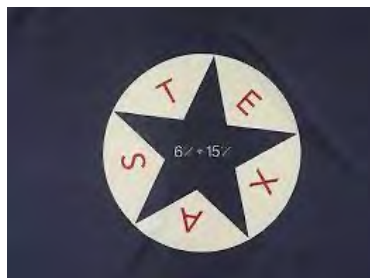
15th Texas Infantry