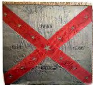
3rd Texas Infantry.