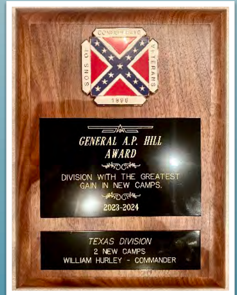
Texas Division Wins A.P. Hill Award!