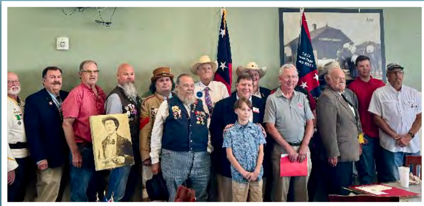
New Camp Chartered in Boerne, TX!