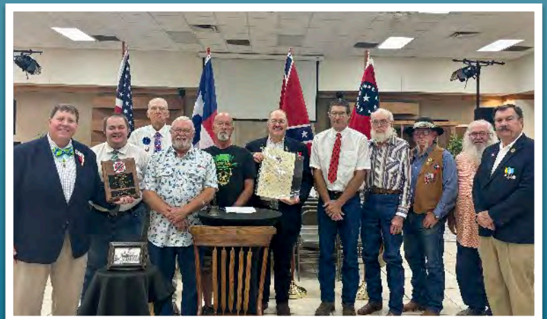
New Camp Chartered in Lampassas, TX