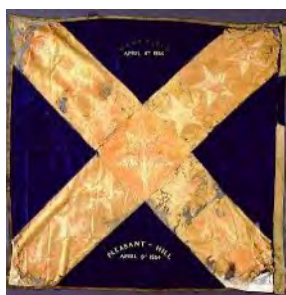
14th Texas Infantry