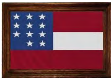
11th Texas Infantry