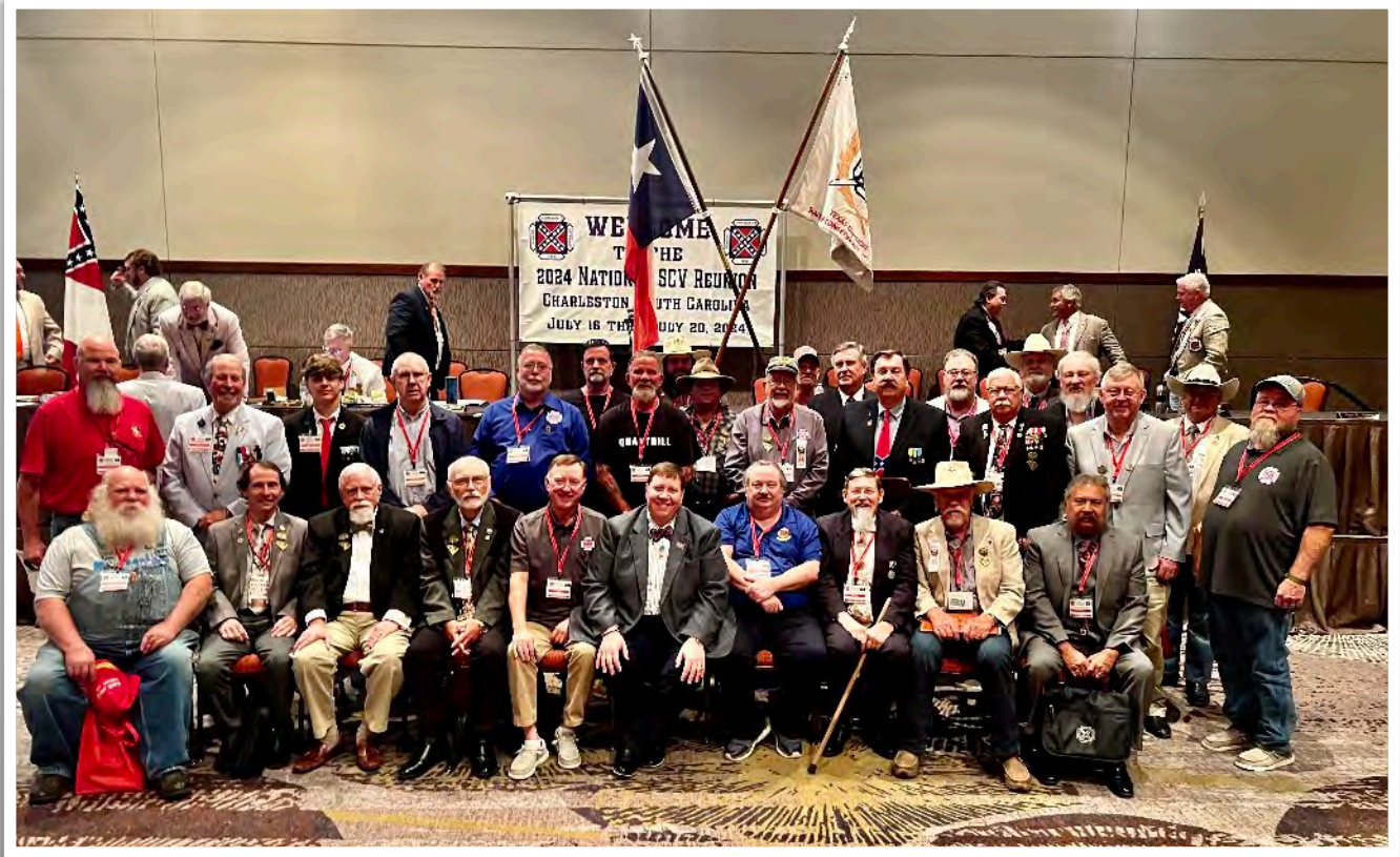
Texas Contingent at the Reunion