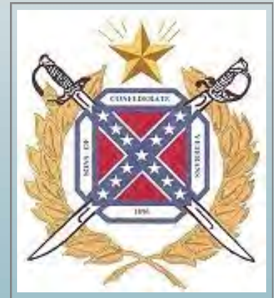
Congratulations to the W. W. Heartsill Camp #314 Marshall, TX on winning the Superior Camp Award in the ATM!