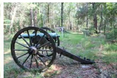
Douglas' Texas Battery