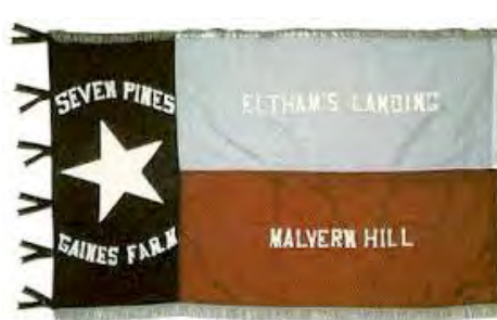
1st Texas Infantry