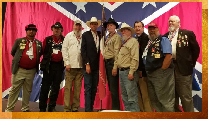
The 2019 Delegation of Hood's Texas Brigade with the newly elected 6 th Brigade Officers.