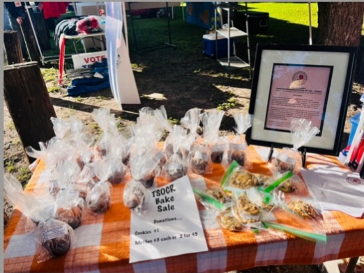
TSOCR Bake sale for 2025 Reunion