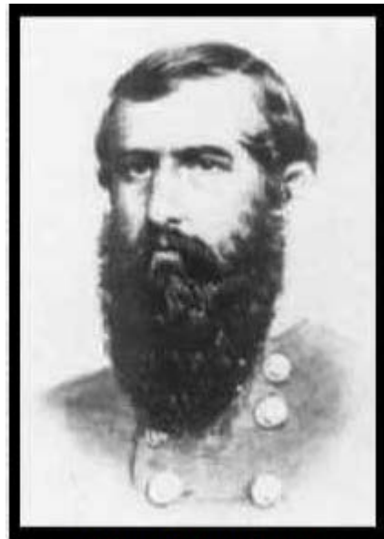
John Clifford Pemberton