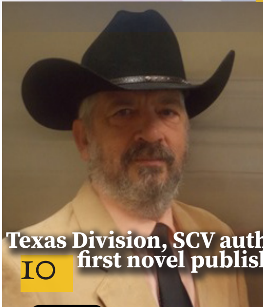
Texas Division, SCV author's first novel published!